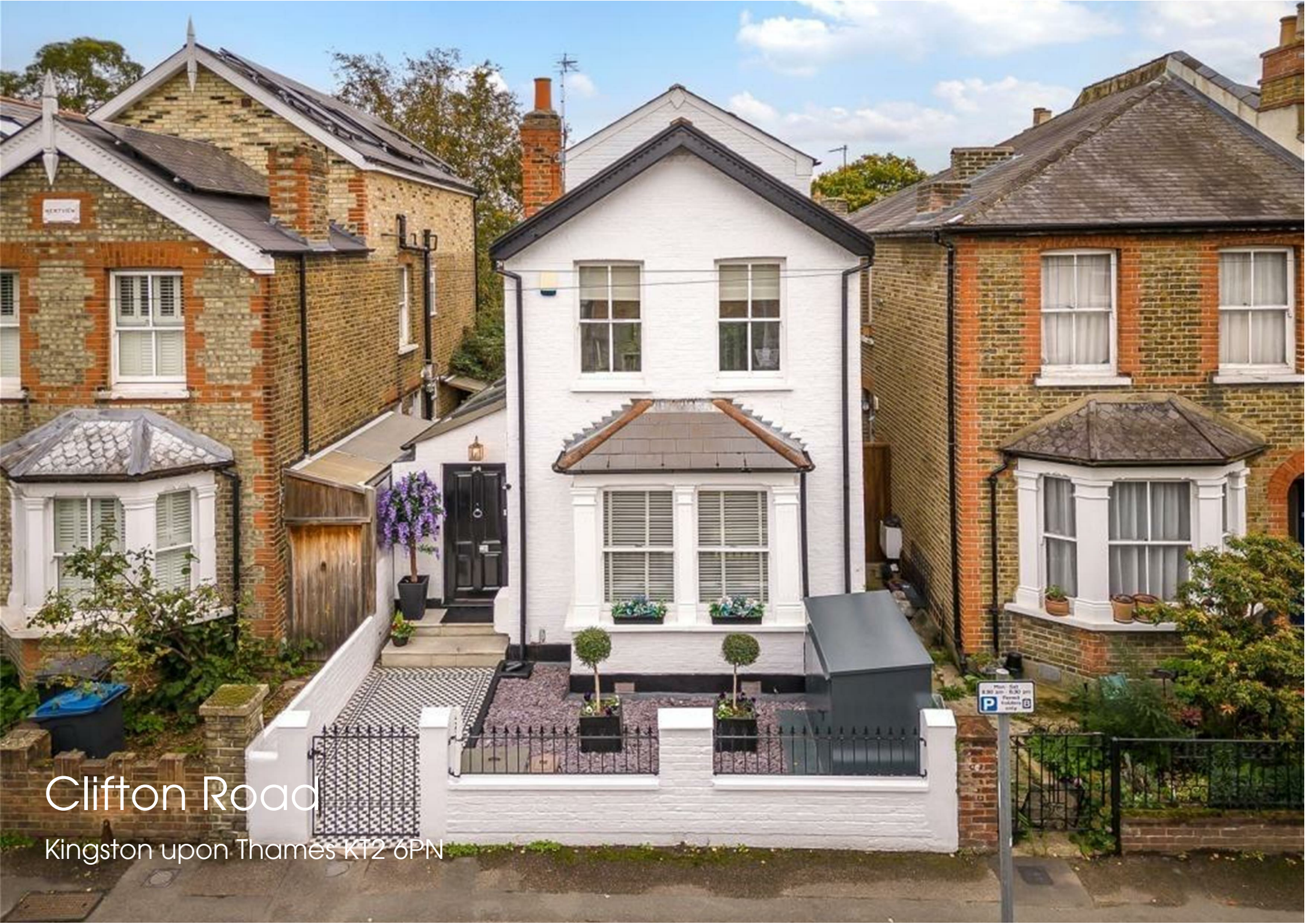
Clifton Road Kingston upon Thames KT2 6PN